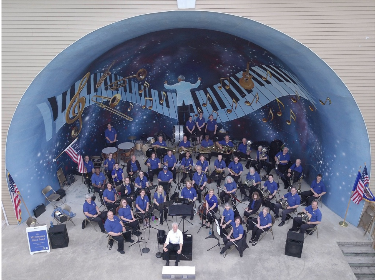
Legacy Concert at Sinclair Lewis Park, Sauk Centre Minnesota June 19, 2019